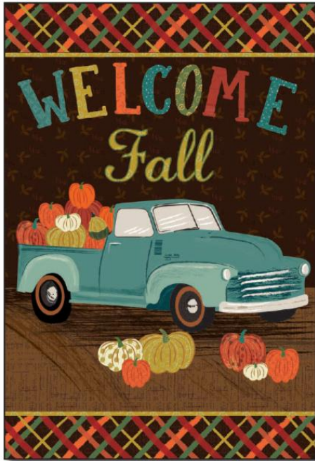
SL-1047e Brown SL-1047d Russet